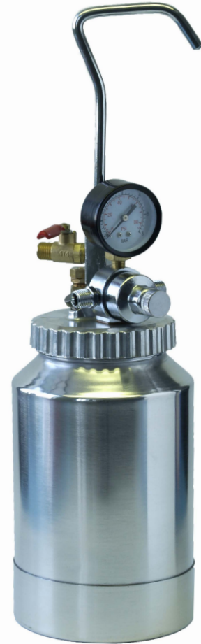
MODEL PT-64 2-QUART PRESSURE CUP

Pressure Release Valve: Manual operation, allows air pressure to bleed from cup.